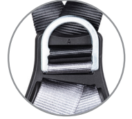
Rear attachment point