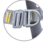
Front attachment point