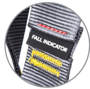
Rip stitch indicators